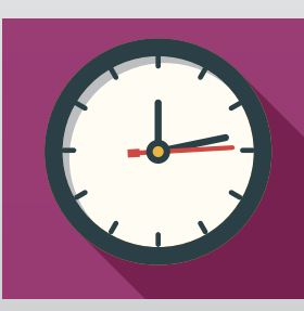
Every 13 minutes, a woman dies from breast cancer.

While the breast cancer mortality rate has declined the number of women and men who die each year is rising and will continue to rise as the aging population grows.